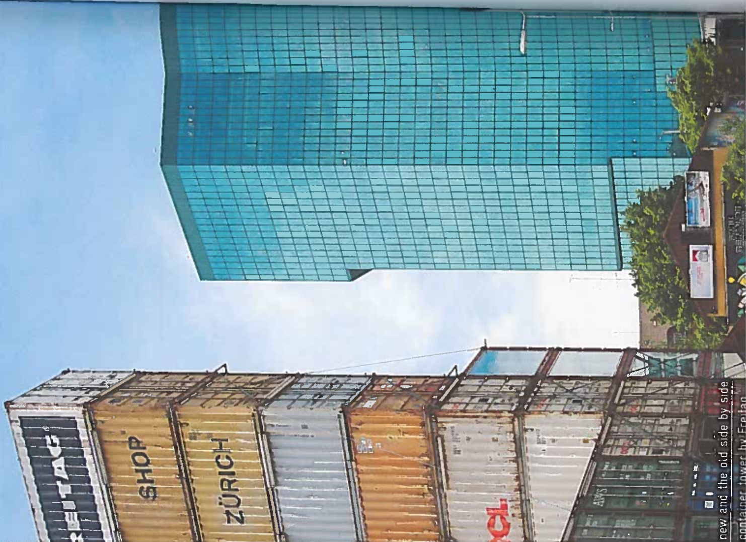
new and the old side by side container tower by Freitan

Next page, a selection of highlights: the best of Zürich-West