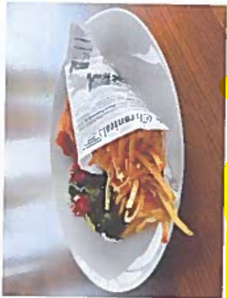
Meals with a view at Clouds