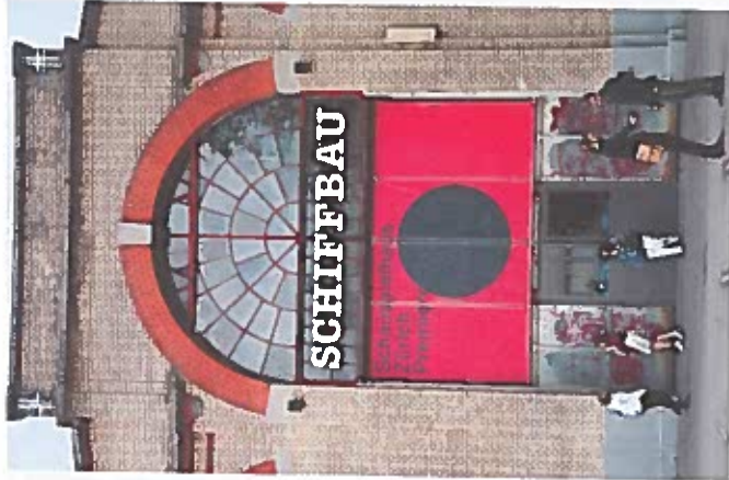
Cultural delicacies: at Schiffbau.