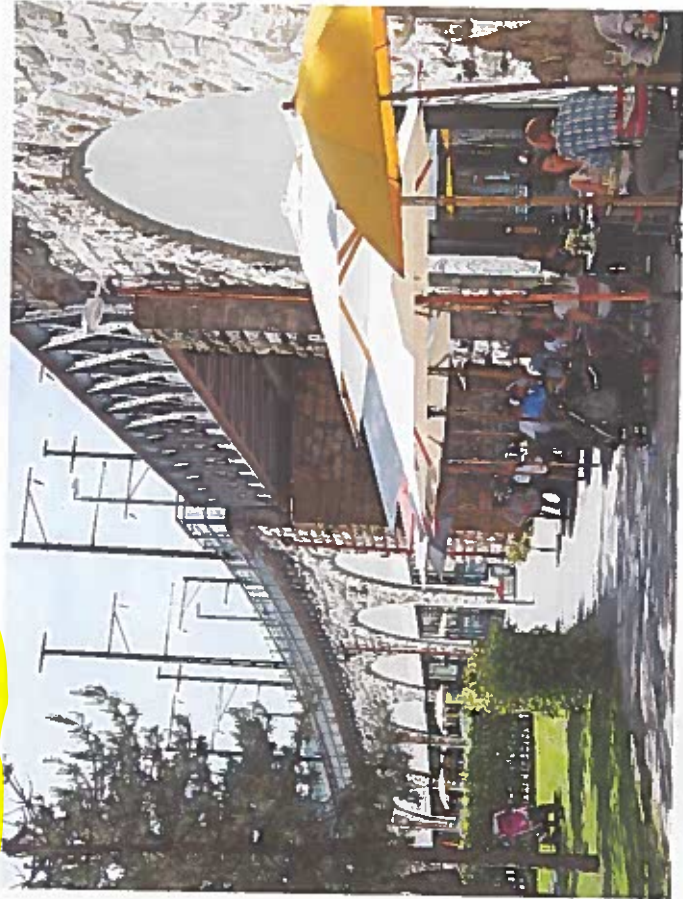
New life beneath the arches: a whole new world is nested in the historic viaduct.